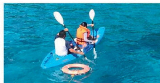
2 DOUBLE KAYAKS