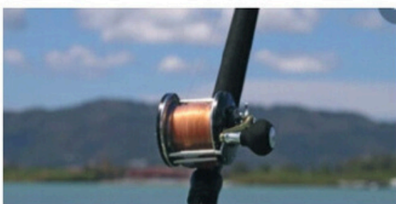
TROLLING FISHING EQUIPMENT