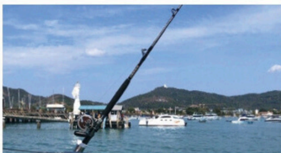
BOTTOM FISHING EQUIPMENT