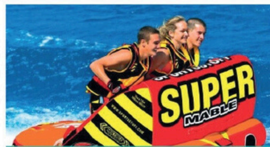
SUPER MABLE SOFA BOAT