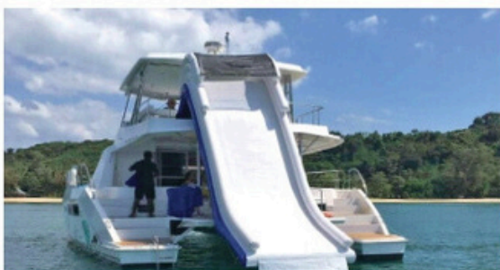
SLIDER: 5.8 M LONG, 2 M WIDE.